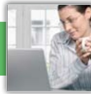
Delivery to users